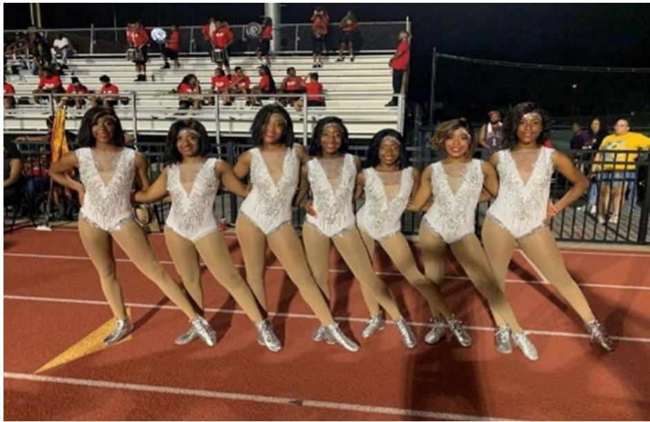
Pearl-Cohn majorettes pose before dancing with The Band of Tradition at a night football game.